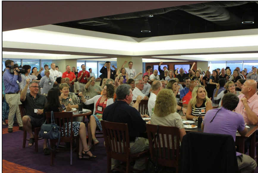
FIGURE IX-3. ITGA CONFERENCE ATTENDEES CELEBRATING IN THE PRESIDENT'S BOX AT HOWARD MEMORIAL STADIUM