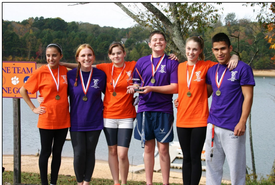
FIGURE IX-1. CLEMSON 2012 REGATTA WINNERS

The JCUAB has been an important programming agent in developing events that bring the City and University communities together. For example, the annual Clemson Regatta was held at the University’s Lake Hartwell facilities for years. The event attracted more than 300 members of the community to meet and row with the University’s women’s crew team to raise funds for local charities. Unfortunately, the popular event ended in 2018 when the University repurposed the land used for this event.